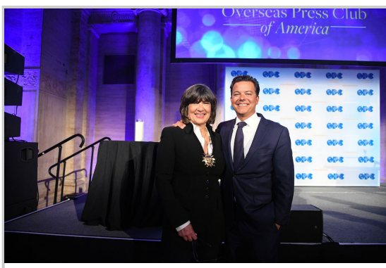
President's Award recipient Christiane Amanpour, left, with OPC Vice President and awards presenter John Avlon.