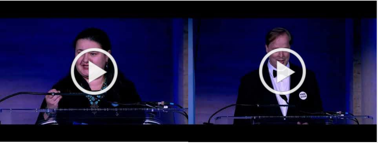
Candle-Lighting Ceremony Oksana Markarova, Ambassador of Ukraine to the United States