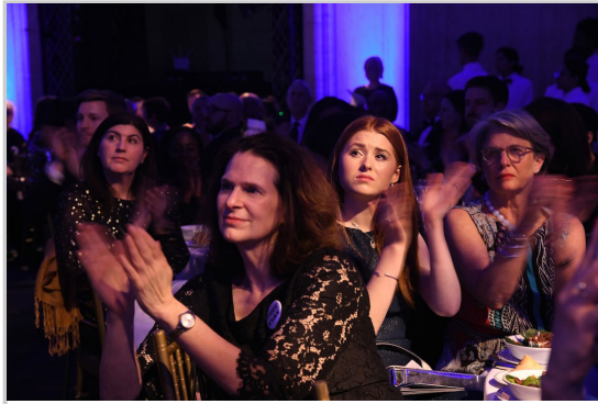
OPC Governor Beth Knobel, in the foreground, watches the ceremony with guests.