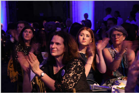
OPC Governor Beth Knobel, in the foreground, watches the ceremony with guests.