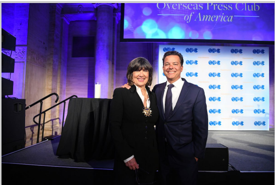
President's Award recipient Christiane Amanpour, left, with OPC Vice President and awards presenter John Avlon.