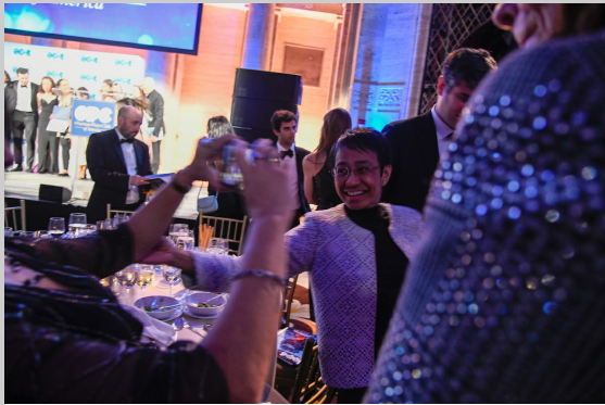
Maria Ressa, center, delivered keynote remarks at the OPC Annual Awards Dinner.