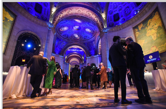
Guests gather for a cocktail reception before the OPC's 85th Annual Awards Dinner.